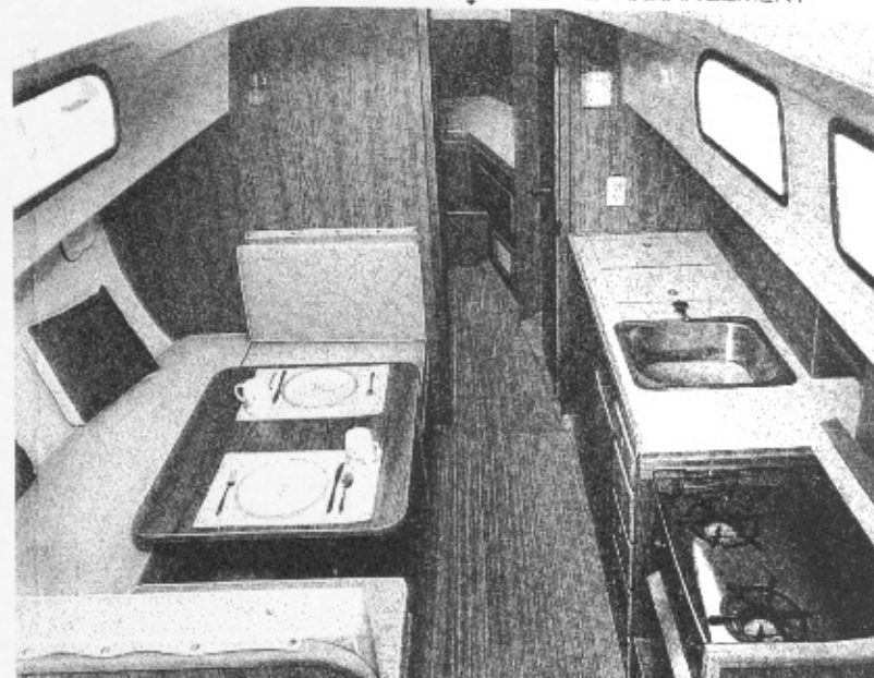
↓ DINETTE ARRANGEMENT